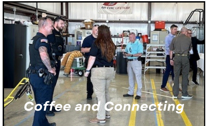
Coffee and Connecting