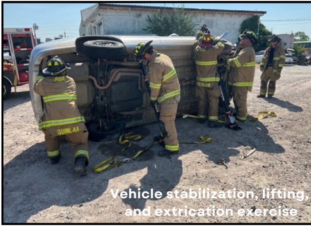
Vehicle stabilization, lifting, and extrication exercise

When Ada Fire Fighters are not responding to an emergency call, that does not mean they are not busy!