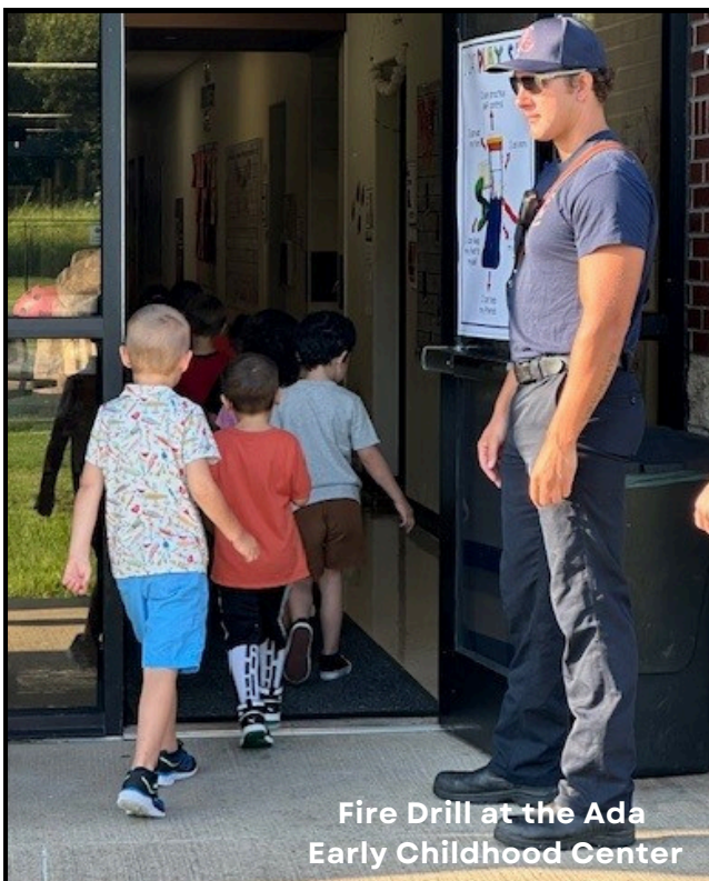
Fire Drill at the Ada Early Childhood Center

Priorities include training, assisting the public, inspections, and so much more!