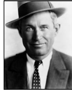
Actor Will Rogers spoke at the Memorial Convention Hall.

The Memorial Convention Hall originally stood on the site of the present City Hall. The impressive two story building cost $100,000 to erect. Will Rogers, several Oklahoma governors, and other dignitaries performed or lectured at this fine center. The building also housed the Ada Youth Center, the American Legion, Boy Scouts, Red Cross, Chamber of Commerce and the National Guard.